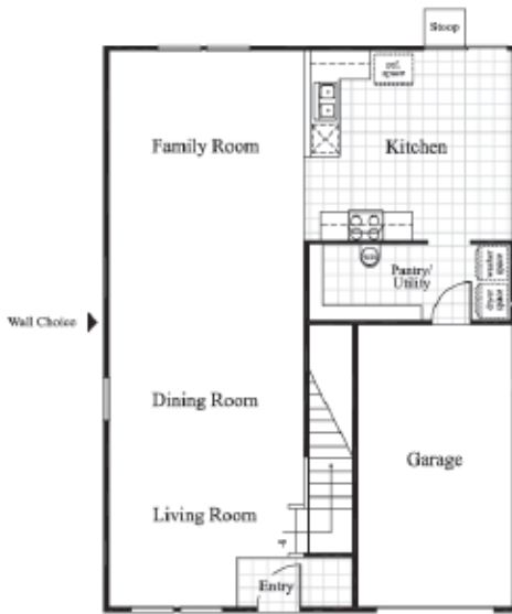
First Floor - Peninsula Kitchen

Welcome to Southton Ranch, where you can relax and enjoy living. Nestled among beautiful country greenery and 2 miles to some "great fishing and camping" at nearby Braunig Lake, Southton Ranch gives you peaceful quiet country living with all the city conveniences nearby. Desired to live in because of all the new developments nearby, this community is located near major employers like Toyota, great shopping, historical parks, schools and restaurants. With easy access to major highways, Brooks City-Base and a short distance from Fort Sam Houston Army Post, Southton Ranch offers the perfect setting for the way you want to live and what you want in a home and neighborhood. So look no further. Welcome Home.