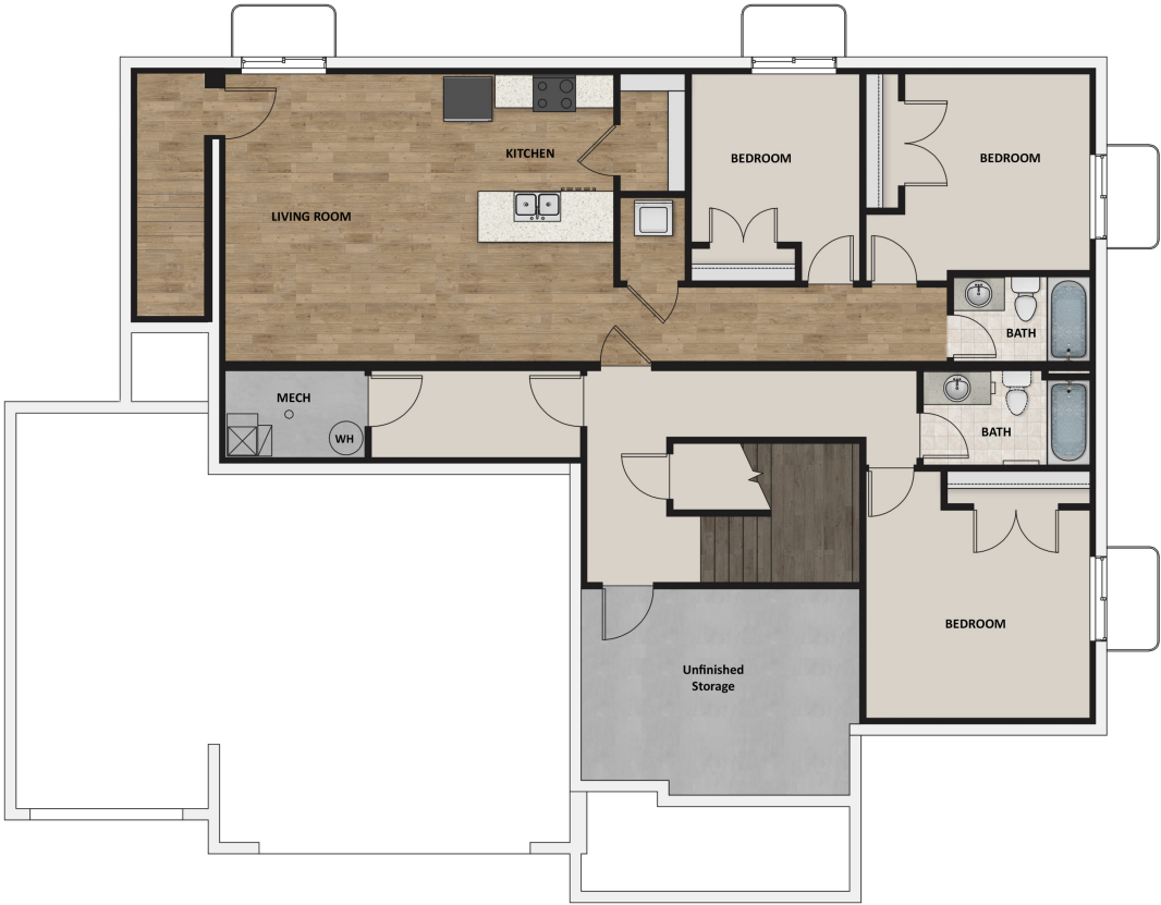
Finished Basement Floor