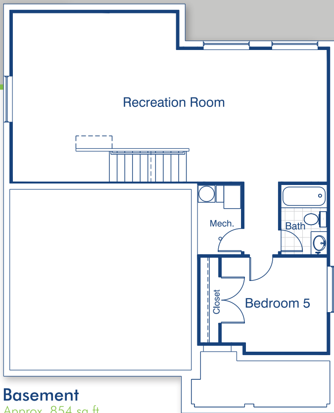
Basement Approx. 854 sq.ft.

BEDROOM 5 9'-3" X 10'-10" RECREATION ROOM 34'-8" X 14'-7"