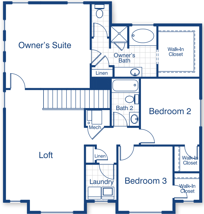
Second Floor Approx. 1,245 sq.ft.

BEDROOM 5 9'-3" X 10'-10" RECREATION ROOM 34'-8" X 14'-7"