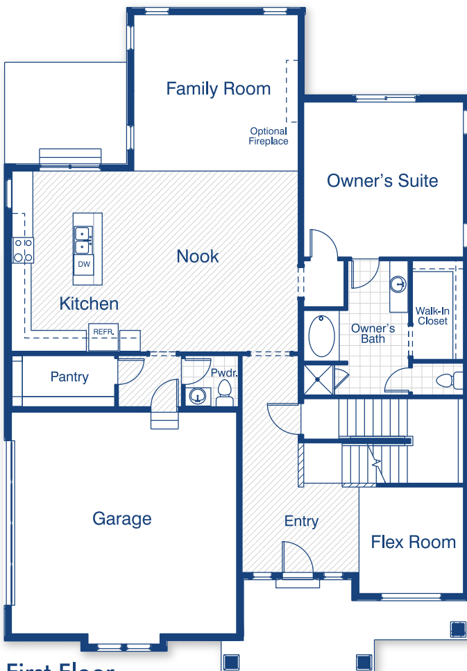
First Floor Approx. 1,819 sq.ft. Approx. 4,387 finished sq.ft.