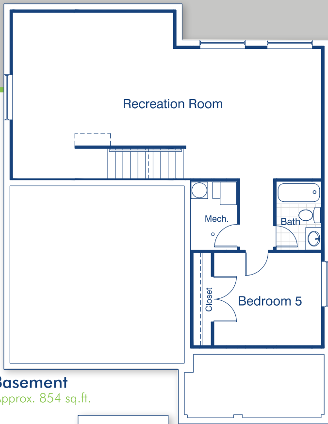
Basement Approx. 854 sq.ft.

BEDROOM 5 9'-3" X 10'-10" RECREATION ROOM 34'-8" X 14'-7"