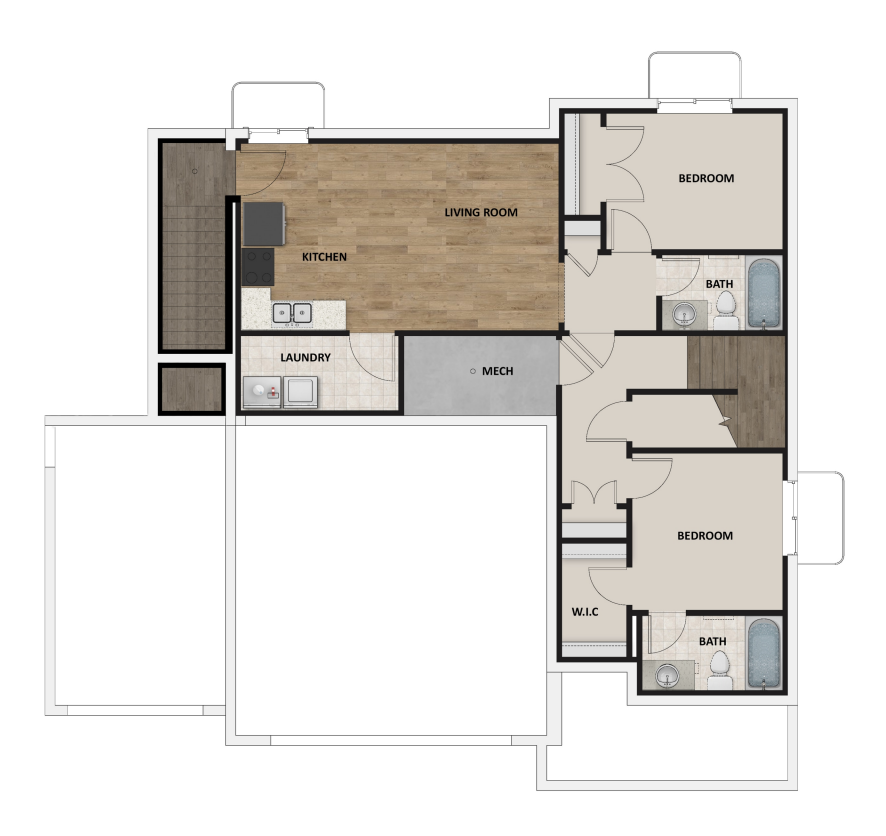
Finished Basement Floor