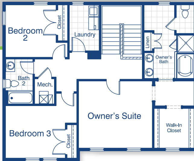
Second Floor Approx. 1,084 sq.ft.