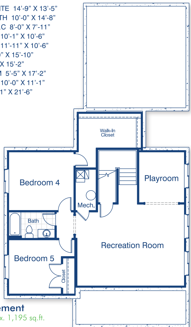
Basement Approx. 1,195 sq.ft.